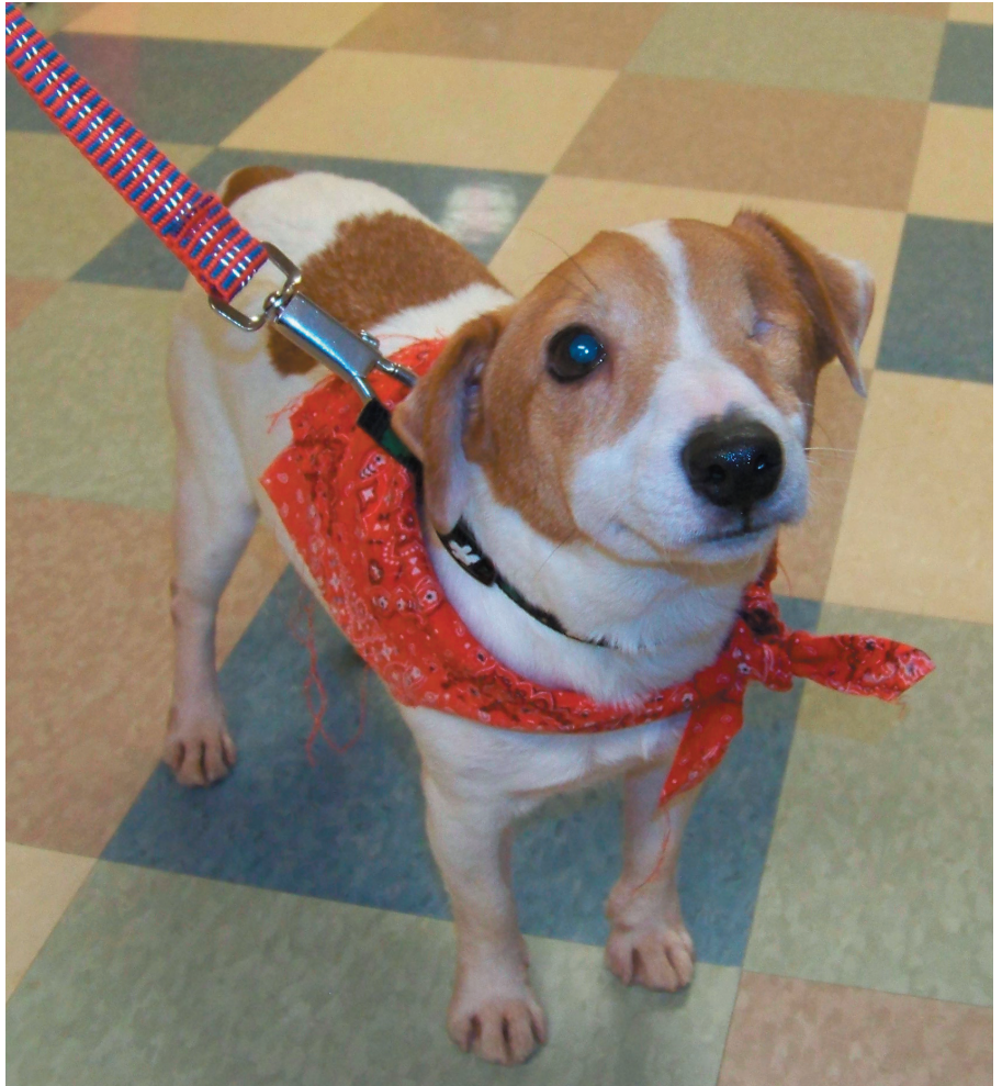
Captain Jack may have just one eye, but he has immeasurable intelligence and energy!