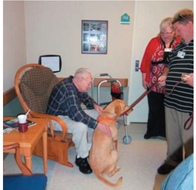
Soldier visits with a veteran during a recent trip to the Mexico Veterans' Home.

One of Soldier's handlers trained dogs with his aunt prior to incarceration. He said he has a passion for helping animals.