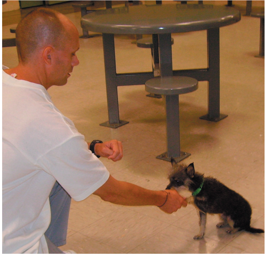
April works on the "shake" command with her offender handler.

"She quickly started picking up on the signs," the handler said. "Every day more of her personality comes out. This has been a life-changing event for me. Caring for another living being is a big responsibility. It's been a very uplifting experience and has encouraged me to turn my life around and focus on something positive."