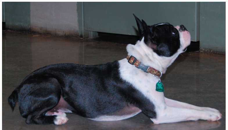
Good dog! Petey, a deaf Boston Terrier, lays on command during a training exercise at South Central Correctional Center.