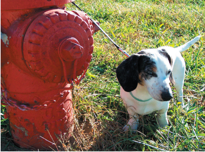
Zeus, a deaf Dachshund now known as Sparky, takes a trip to the fire hydrant.

Offenders at the South Central Correctional Center (SCCC) in Licking made worldwide headlines this year. They gave Zeus, now known as Sparky, a second chance at life. Zeus was born deaf. The birth defect rendered him useless to the breeder and his future was uncertain, at best. The Dachshund ended up at an animal rescue shelter where his handicap plagued any chance for adoption. The shelter reached out to SCCC, which participates in the Department of Corrections' (DOC) Puppies for Parole Program.