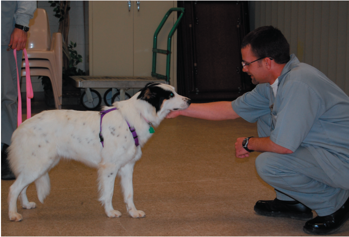
Faith receives some positive reinforcement from one of her offender handlers during a training exercise.

One offender handler said he believes Faith liked to be on the top bunk because she was closer to eye level with people. Both offenders said Faith was very intelligent and was relatively easy to train once they got past her anxiety.