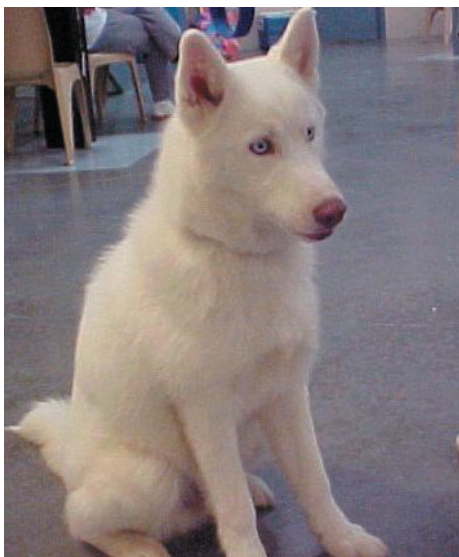
Koda sits during a training session at Jefferson City Correctional Center.