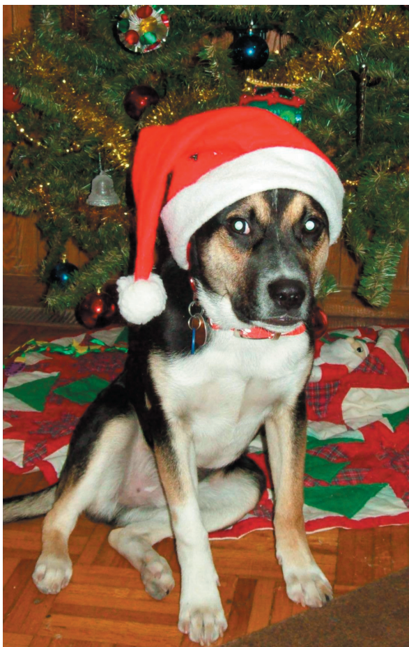
Ho, ho, ho! Memphis enjoys his first Christmas at his new home - Marshall Habilitation Center.

Missouri Residential Services while Memphis, a mix breed from Jefferson City Correctional Center, went to Marshall Habilitation Center.