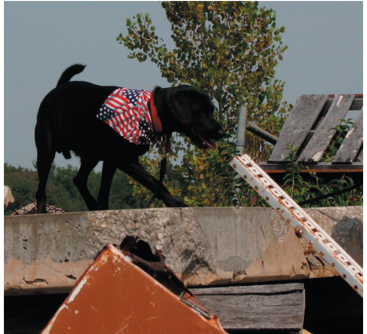
And action! Stewey shows off his skills in the field of tracking.