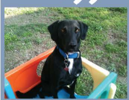
Phil, an intelligent Lab mix, learned various tricks at Farmington Correctional Center before being adopted.